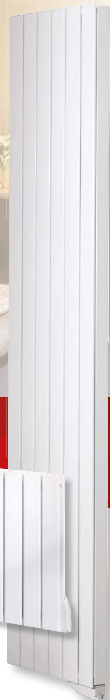
ELECTRIC DÉCOR VERTICAL