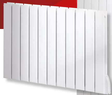
ELECTRIC DÉCOR HORIZONTAL

The electric DÉCOR is a stylish, contemporary alternative to a traditional radiator. An electric version of our popular hydronic model, the distinctive flat tube design will enhance the look of any room. It is suitable for a wide range of uses, both domestic and commercial. It is also perfect for projects that are off-gas or have no central heating pipes installed.