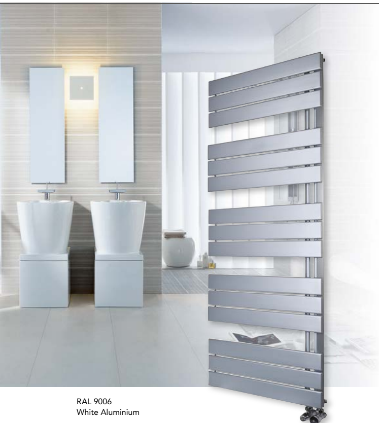
RAL 9006 White Aluminium