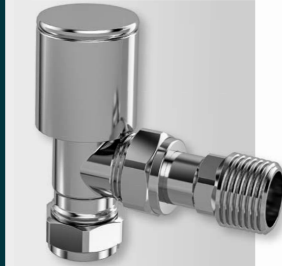
DEC_10LWACSLIM - SLIMLINE

DECORATIVE manual valves are offered in three two styles; Slimline, Modern & Traditional.