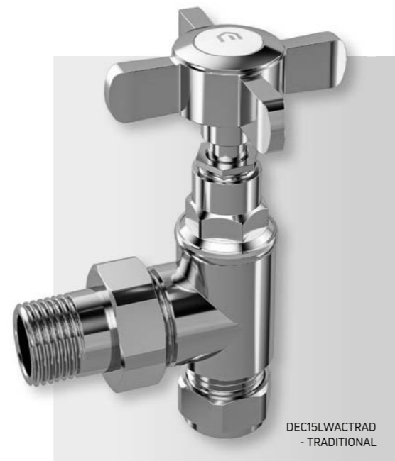
DEC15LWACTRAD - TRADITIONAL